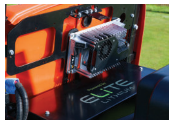
ELITE™ lithium battery & on-board high frequency 18 amp, 48V DC output, 85 - 265V AC 45 - 65 Hz input