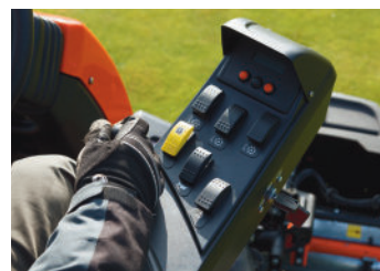
Programmable frequency of clip