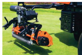
Easy access swing-out centre cutting unit

New linear actuators with exceptionally long life